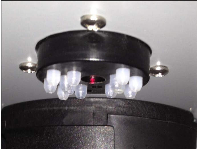
Nozzle cluster without Moisture Seal. Humidifier Cup in open position.