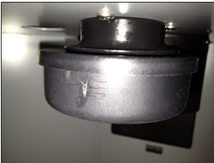
Nozzle cluster with Moisture Seal and Humidifier Cup in closed position.